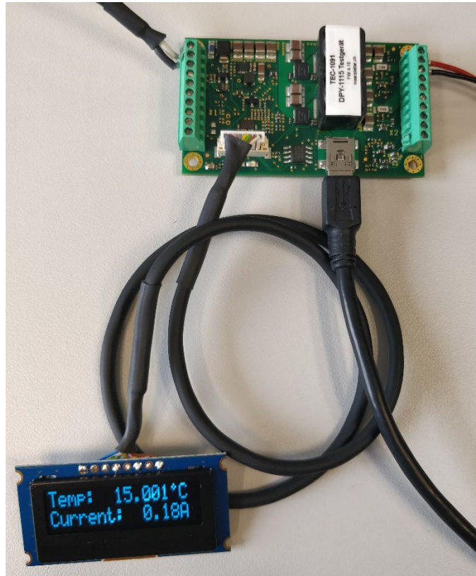
Display connected to TEC controller