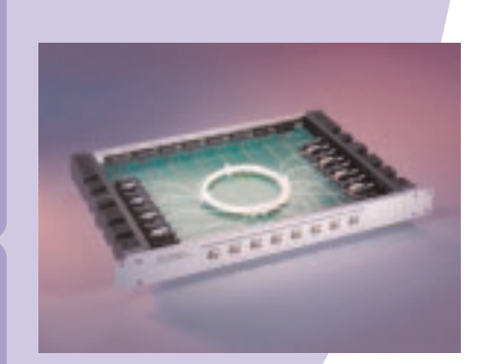
Laser diodes not included