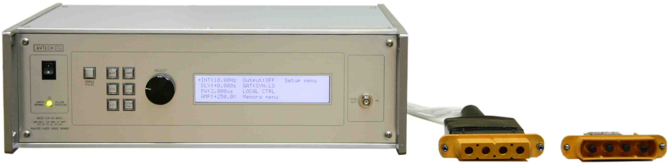
AVOZ-E4-B, with AV-HLZ2-100 output cable and mating AV-HLZA2 Adapter / Test Load