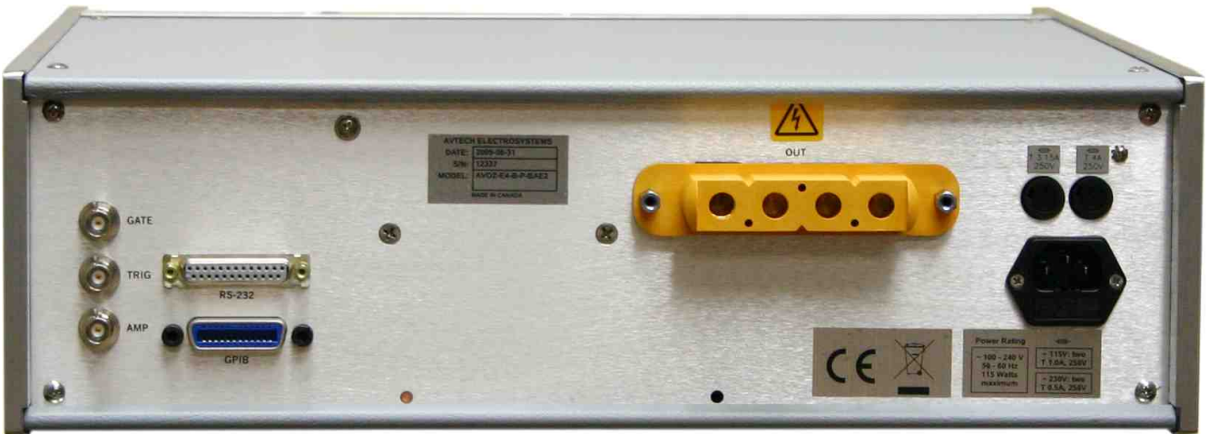
AVOZ-E4-B Rear Panel