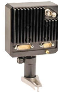
Features on the back side