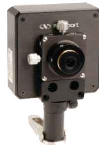
Mount with Collimation lens Assembly